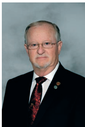
Rocky Woods Trustee - District 1

CHEC will send notices to cooperative members in each of these districts. Please read your district meeting notification carefully. If you have questions about the district meetings, please feel free to call 800-328-2368.