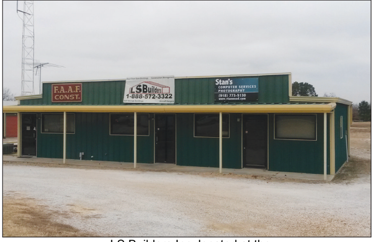
LS Builders Inc. located at the intersection of Hwys. 82 & 100

many projects together over the years. Twelve years ago they teamed up to build the CHEC office in Sallisaw. Stelljes' specialty was the building itself, and Adams' was the interior. They also constructed the shop for the new headquarters facility in Stigler two years ago.