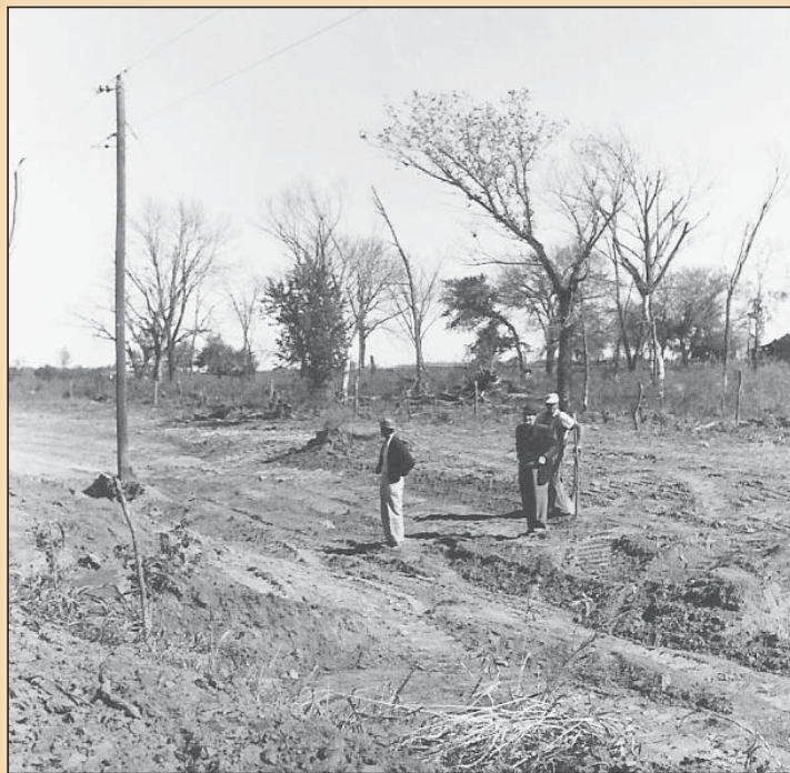
A new pole goes up in 1955

Supplies such as poles, copper wire, and transformers were used for the war effort. After the war ended there was a serious shortage of materials. The determined farmers continued their quest, and their determination paid off. The coop's lines were finally energized on June 28, 1948, bringing Southeast Oklahoma out of the darkness. A total of 187 miles of line was energized to serve 502 members. Electricity spelled a new kind of life for farmers and residents of our area.