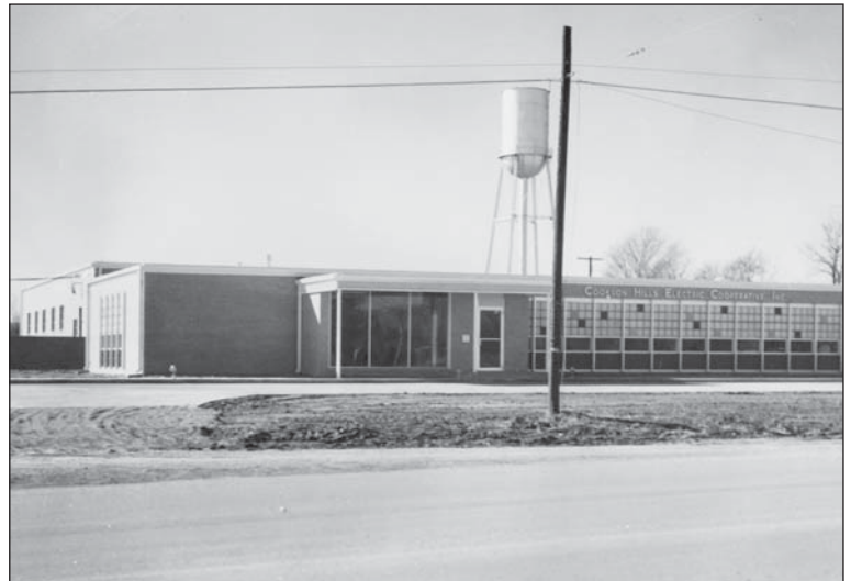
CHEC Headquarter's Office: May, 1960 - December, 2012