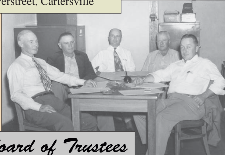
A Board of Trustees meeting in the early years