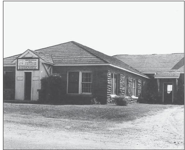
First CHEC Headquarter's office: March, 1946 - May, 1960

CHEC plans to host an open house at the new headquarters office later this year. Please watch your Hot Watts for announcements regarding this event!