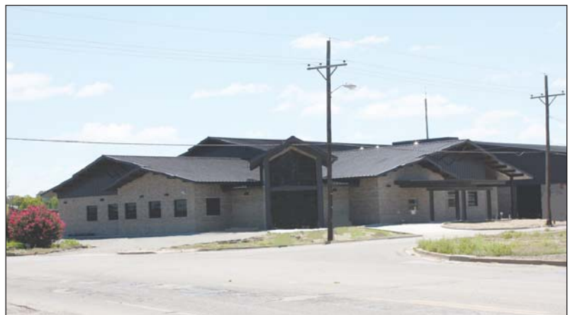
New Headquarter's Office: Opened July 25, 2014