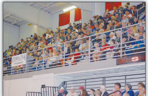
Members attend 2013 Annual Meeting at Sallisaw.