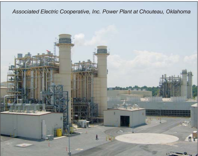
Associated Electric Cooperative, Inc. Power Plant at Chouteau, Oklahoma

For more than 50 years, AECI has provided reliable, wholesale power generation and transmission to its six transmission co-op member-owners. They supply 51 local electric cooperatives