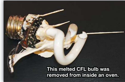
This melted CFL bulb was removed from inside an oven.

Replacing lightbulbs with efficient CFLs or LEDs saves energy, but not every bulb works under extreme temperatures.