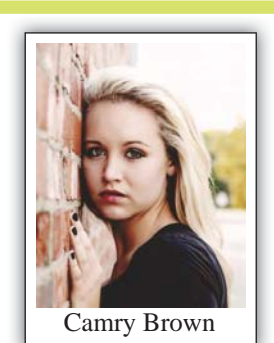
Vian High School