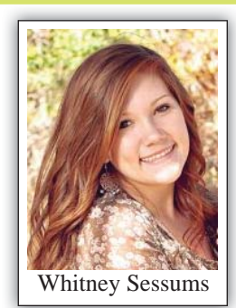
Roland High School