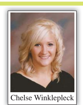
Keota High School