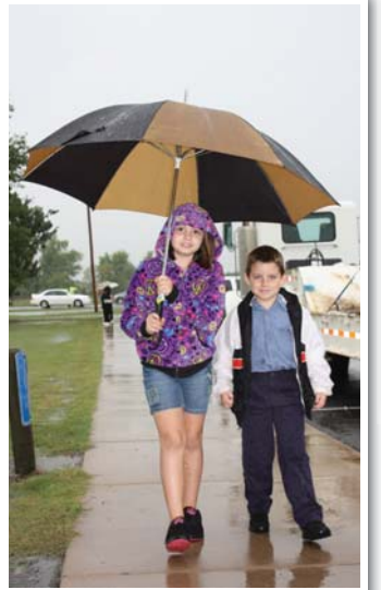
Future CHEC Members