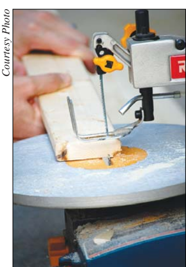
Read power tool instructions and adopt safety measures like using equipment guards, wearing eye and ear protection, and securing long hair and loose-fitting clothing.

Do-It-Yourself (DIY) offers a great way to save money and learn new skills. But before you tackle that home improvement project, practice these safety measures to avoid injury while getting game-winning results.