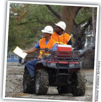
Osiose Utilities Services

After the inspections are completed, all condemned poles are replaced and good poles are treated to prevent decay. Pole replacements are prioritized based on the condition of the poles. By maintaining pole integrity Cookson Hills' system is much safer as well as reliable.