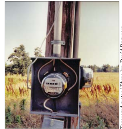
Tampered meter

Since everyone pays for lost power, please let us know if you suspect meter tampering. Do not attempt to approach the individual or confront them. Call CHEC at 918-967-4614 or 800-328-2368 to report possible theft of electric service. All information can be given anonymously.